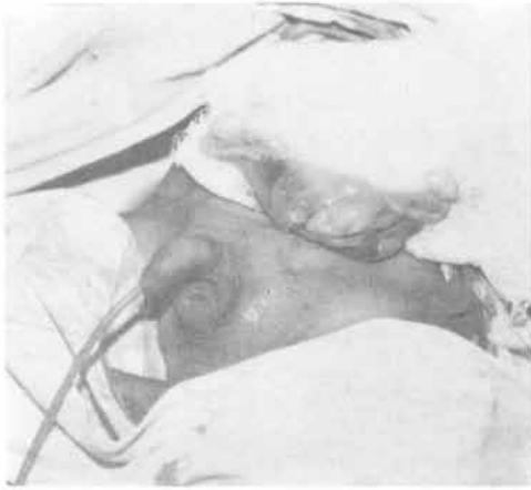
Photograph No. I