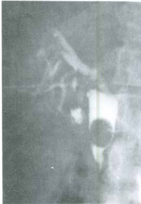
11- Photograph showing P.T.C of a patient having residual stone C.B.D. This patient had Choledocholithotomy and C.D.D.

mucosa full thickness sutures are applied continuous, with 2/0 catgut. The mucosal suture may be continued to anterior inner layer after locking at the corner. Anterior outer layer is stitched with 3/0 interrupted silk sutures. Sometimes few additional interrupted sutures with silk 3/0 or Chromic catgut 2/0 can be applied to reduce tension on suture line. Some other modifications have been mentioned in literature. 12