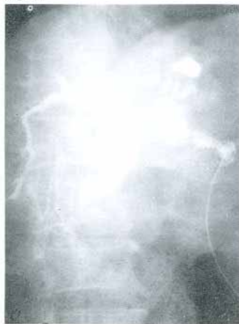
1. Technique of Choledochoduodenostomy.

In our series the main indication was choledocholithiasis as primary problem. In 5 cases this procedure was performed for retained/missed bile duct stone (1.8%), which is also offered by Lagidakis NJ, as definitive solution to this problem 1 (Fig. 1).