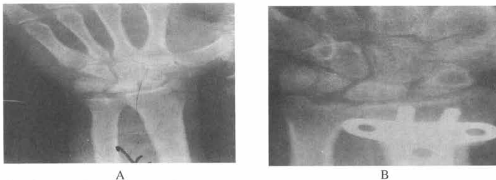
Fig. 1 (A) Pre operative radiograph of a patient with stage (III), negative ulnar variant. (B) Post operative radiograph of the same patient with the improvement of lunate height and with zero ulnar variant.

On radiological measurement to note the progression of the kienbock's disease. The most useful was the width of the lunate. The mean increase was 2.5 mm, as shown in Fig-1. The flattening of the lunate has improve in three patients (60%), as shown in Fig-2, and unchanged in two patients (40%).